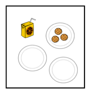
Collective picture Todo biscoito estava num prato OR Todos os biscoitos estavam num prato 'Every cookie was in a plate'. 'All the cookies were in a plate'.

As a whole, the results were compatible with what was obtained in the picture selection experiment. For the Q-expression todosos , there was a strong preference for the collective choice: 92% of YES judgments for this configuration compared to 46% for the combination with distributive pictures. For todo + NP, the mean of YES judgments for the collective picture was also quite high (89%) when compared to 56% for the distributive one. Regarding reaction time, there were significant differences between the distributive and collective pictures, both for the plural and singular Q-expressions. The reaction time for YES judgments was significantly higher for distributive pictures in general, suggesting that this was the less accepted option.